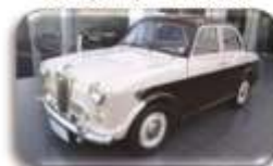
1958 Wolseley 1500 – R55 000