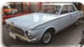
1963 Chrysler Valiant – R128 000