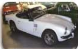
1971 Triumph Spitfire – R70 000