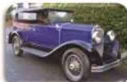
1927 Chrysler Imperial – R248 000