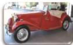
1950 MGTD – R228 000