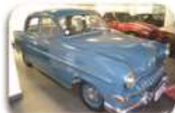
1954 Opel Kapitän – R88 000