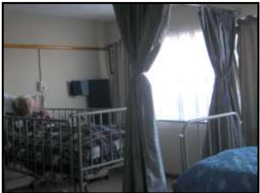
July - August 2015

Boekhouer / Admin HUIS VIR BEJAARDES JJ WATSON