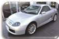
2004 MGTF – R110 000