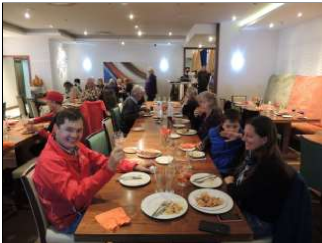
July - August 2015