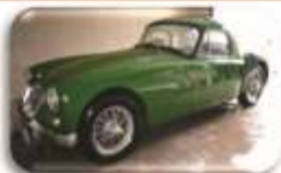
1958 MGA Hardtop – R148 000

We buy & sell all makes of classic, sports, vintage cars and motorcycles. Consignment sales welcome.