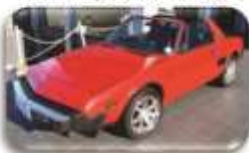
1979 Fiat X1/9 – R95 000