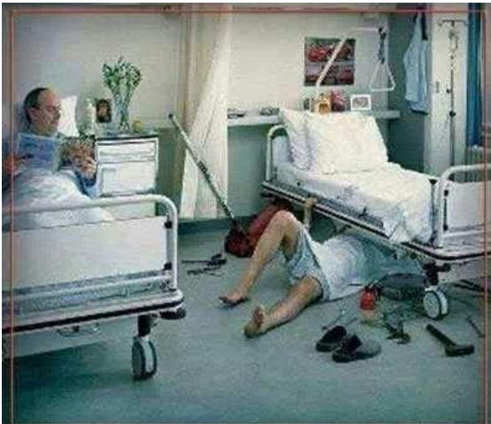
What happens when Old Car Guys get sent to the Nursing Home