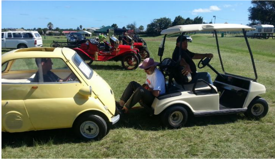
How to tow an Isetta that has lost its brakes